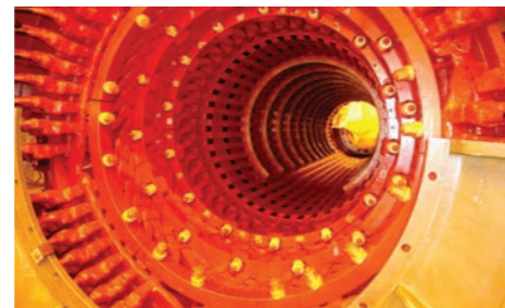
Power Generation Reliability and performance