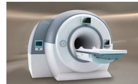
Medical Equipment Supporting innovation