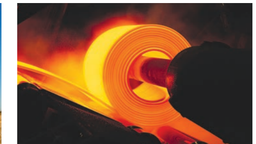
Heavy Industrial Tough, versatile, easy to machine