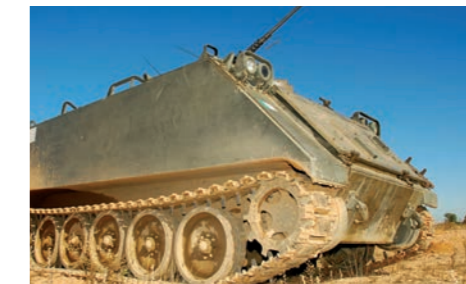
Military Critical ballistic protection