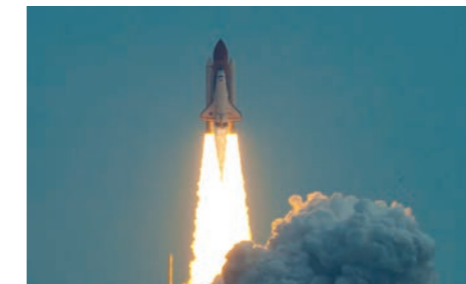
Aerospace Proven in deep space