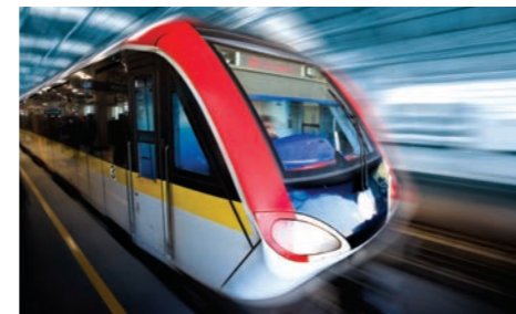
Transportation Durable solutions on the move