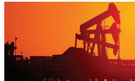
Oil & Gas Designed for extreme environments

Norplex-Micarta continues to develop specialized thermoset materials for the next generation of applications.