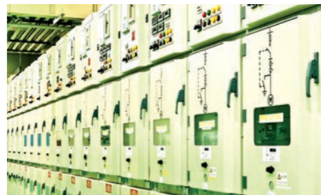
Electrical Devices Precise properties for advanced tech